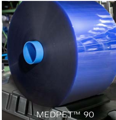
MEDPET™ 90 New medical-grade APET that is #1 recyclable

From MD&M (Medical Design and Manufacturing) for the medical thermoforming market, to PackExpo for the food packaging market, to Printing United for the graphics market, GOEX promotes an all-star list of products you won't want to miss including: