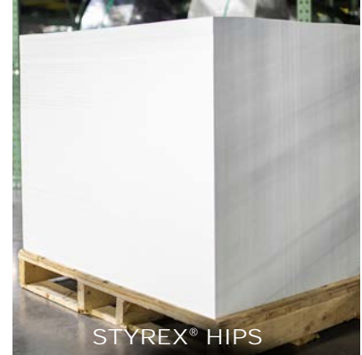
STYREX® HIPS Provides reliable performance plus yield advantage

Each show we exhibit at is an opportunity for us to also strengthen our relationships with both prospective and existing customers. We always look forward to interacting with an audience that is genuinely interested in the quality products we offer. These shows allow us to establish our brand as a true industry leader and garner feedback that can help our company improve.