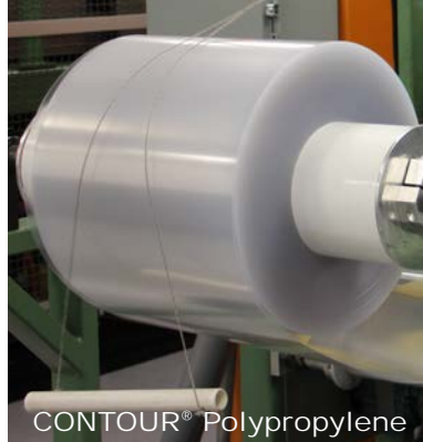
CONTOUR® Polypropylene High in moisture barrier and heat deflection properties